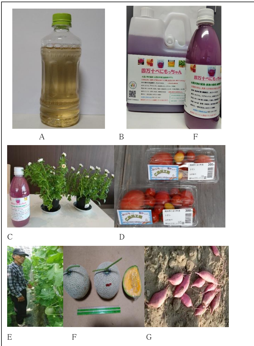
Fig. 4. K.alvarezii juice: A; filtered K.alvarezii juice; B; filtered juice of frozen K.alvarezii fronds

C: Flowers: daisies, characterized by large leaves