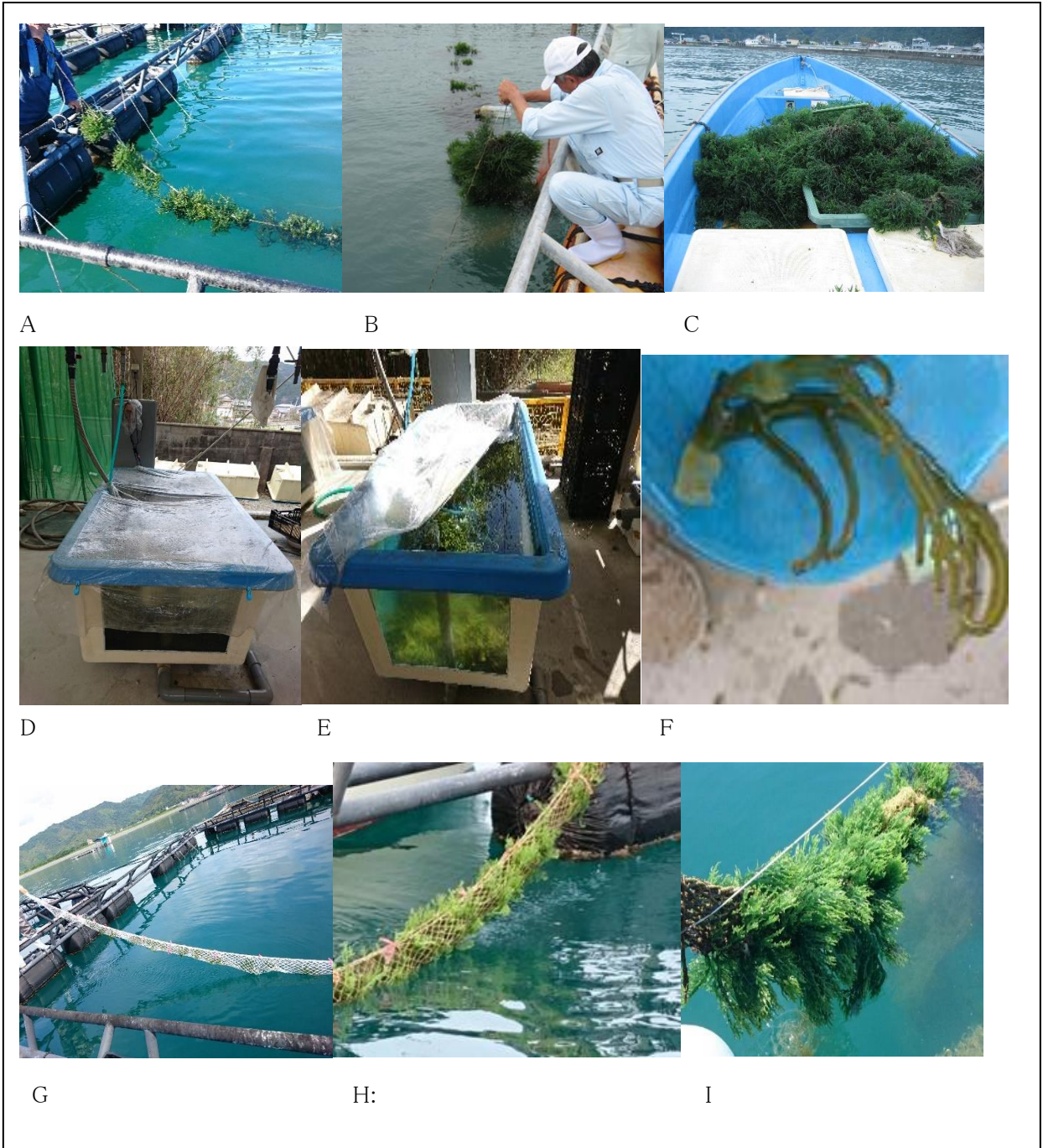
Fig.2 Cultivation methods of Kappaphycus alvarezii with fish cage in Tosa Bay in Japan