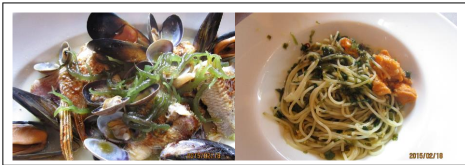
Fig 3 Italian1dishes with K.alvaresii materials

It is also recognized as effective as a seaweed fertilizer., K.alvarezii cultivation in Japan will continue, if demand for these increases.